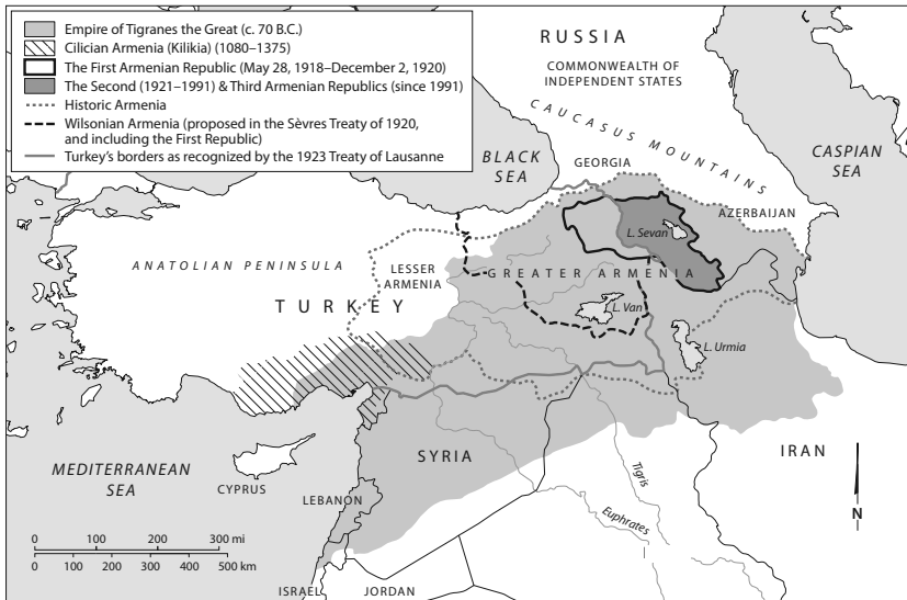
Figure 2. Map of Armenia and Turkey. Adapted from Robert Hewsen, Armenia: A Historical Atlas (Chicago: University of Chicago Press, 2000), 13.

almost every Ottoman city, town, and village, they were mostly concentrated in what is today called eastern Anatolia, roughly the six Eastern Provinces (Doğu Vilayetleri) of the Ottoman Empire, which Armenians referred as the western part of their historical homeland (see Figure 2), that is, the western part of the geographic unit known as the Armenian Plateau. 7 This region comprised the critical borderland between the Ottoman Empire and Russia, the Ottomans' archenemy. On the other side of that border lived Armenians of the eastern part of the historical homeland who were Russian subjects. The Young Turks feared that Armenians from both sides of the border would exploit the crisis of the war and join forces to declare independence or merge with Russia. Exaggerating the importance of some cues of dissent as the early signs of a wholesale Armenian uprising, the Ottoman government decided to preempt any threat by deporting Armenians to the remote and uninhabitable corners of the empire. Under this "deportation" the Committee of Union and Progress (CUP), the ruling Young Turk faction, implemented policies aimed at eliminating Armenians as a meaningful demographic presence in any part of the empire. The war gave them the opportunity to finally solve