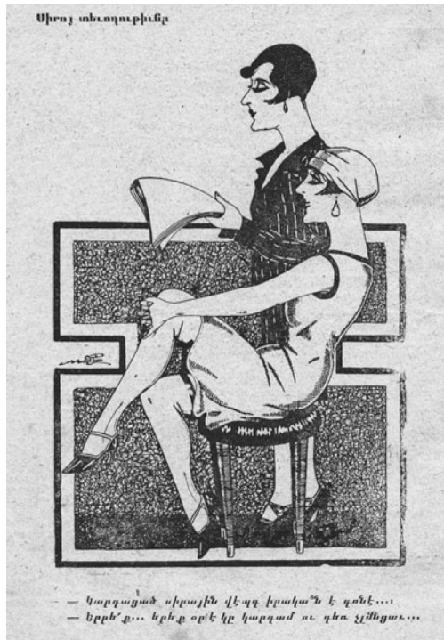
Figure 22. “Duration of Love.”

— Is the romantic novel you’re reading based on a true story?