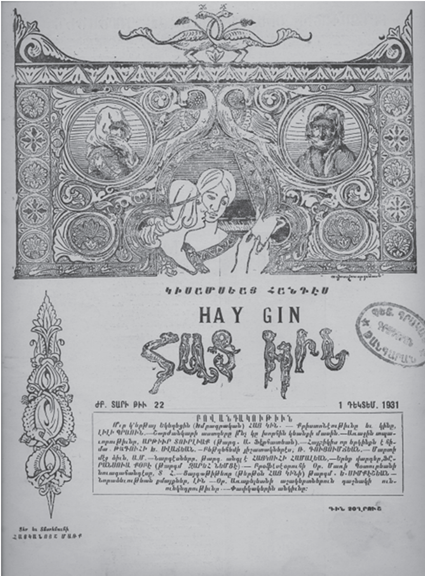
Figure 14. Cover page of Hay Gin , December 1, 1931. The women in the center symbolize the “new Armenian woman” while those in the two upper corners represent the “old Armenian woman.”