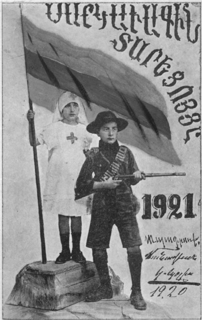
Figure 3. Cover page of the almanac Sargavakin Daretsuytse showing Armenian children defending their newly acquired fatherland, an Armenia they hoped to expand. Sargavakin Daretsuytse (n.p., 1921).