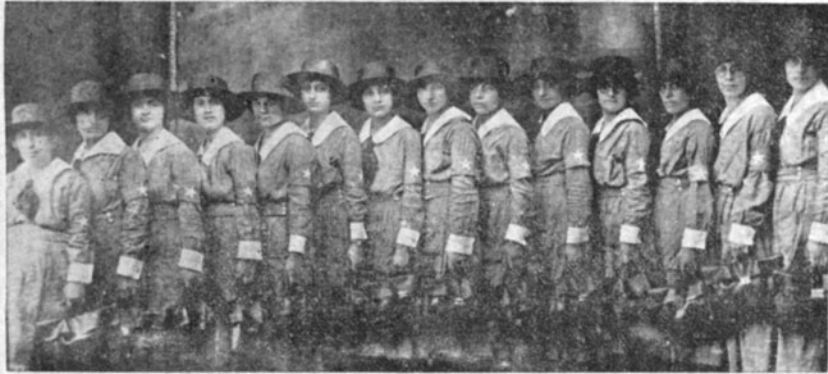
Figure 10. “The Little Army Against Disease.” Both Armenian medical organizations and Near East Relief trained Armenian girls in nursing in order to meet the ever-increasing need among orphans and refugees. The New Near East , September 1922, 12.

woman, who superbly nurtured her own family while caring for all the nation’s children as well as the soldiers fighting to provide a secure homeland for Armenians. She was the she-soldier, a member of the “army against disease.”