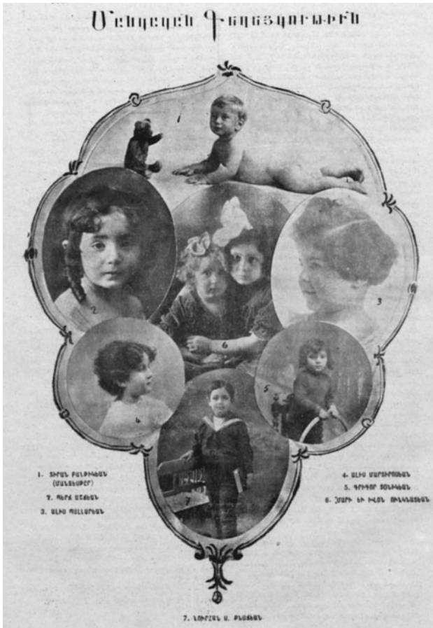
Figure 5. Hay Gin 's "pretty baby contest." The journal organized these baby contests to instill in the survivor-nation the conviction that Armenians had a bright future. People from Cairo, Fresno, Paris, Brussels, Ethiopia, New York, Beirut, Tbilisi, and Yugoslavia, and elsewhere, sent pictures to the journal. Hay Gin 1, no. 7 (February 1, 1920).