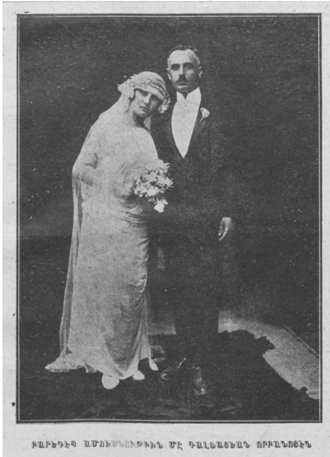
Figure 9. "A Dignified Marriage from the Kalfayan Orphanage." Weddings of orphaned or rescued girls were a source of happiness for the Constantinopolitan Armenian community. Here an Iranian Armenian carpet dealer marries an orphaned girl. Hay Gin congratulated the groom for choosing his spouse from an orphanage, an act "that proved to everyone how benevolent he was." Hay Gin 4, no. 20 (October 1, 1923).

in white, we felt as if we recognized the smells of martyrs' souls, who (forgetting their tortures, the suffering of exile, the blood-filled lakes that they had seen, and the whip of the merciless Turkish sergeant) came, in the company of little angels, to witness the wedding of a sweet budding flower who was going to sprout on top of embellished mountains and give beautiful flowers so that the nation/race [ tsegh ] will invincibly continue. 64