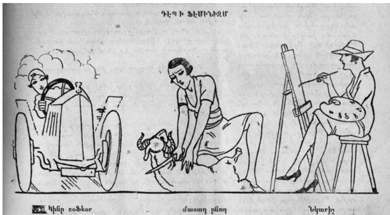
Figure 23. “Toward Feminism.” The press frequently employed the same type of female figure to depict both decadent and dangerous modern girls and feminists. The three women depicted here ( from left to right : as a motorist, as a ritual butcher, and as an artist) represent anxieties associated with the mixing up of traditional gender roles. Anushabur–Badger, September 1, 1927.