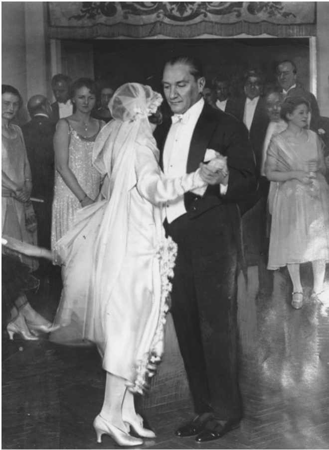
Figure 19. Atatürk dancing with his adopted daughter at her wedding in 1925. Armenians took heart in seeing Turkey’s modern, Westernized, “civilized” new leaders.

heels—was really changing (see Figure 19). And it was changing in the direction that Armenians would want: from East to West. Since at least the early nineteenth century, large sections of the Armenian intelligentsia worldwide had identified their nation with a superior Western “civilization” to which they argued Armenians belonged thanks to their religion, history, language, and lifestyles, including how their women occupied a cherished place in society. Bolsahay elites were now observing that the Turks too were finally understanding that the Western—thus, civilized—ways were better than