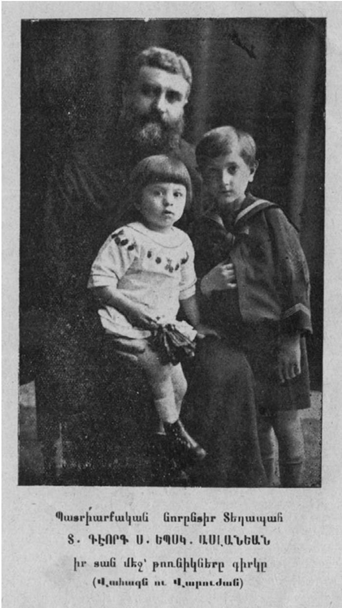
Figure 16. "The newly elected patriarchal locum tenens Bishop Kevork Aslanian in his home with grandchildren (Vahakn and Varuzhan) on his lap." Hay Gin 4, no. 2 (January 1, 1923), cover page.